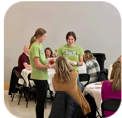
NHS students serving drinks at the Staff Appreciation Banquet

Plans are underway for next year’s staff appreciation banquet which will be held April 13th, 2023 at Building 1225. The dinner is provided to honor the work and effort that the staff of CUSD #300 put in each year. This year, we want supporters and community members to join us in celebrating the work that is being done in our community in the field of education. More details forthcoming as plans are finalized.