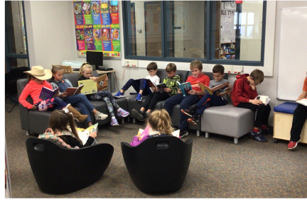
New library furniture for SES.